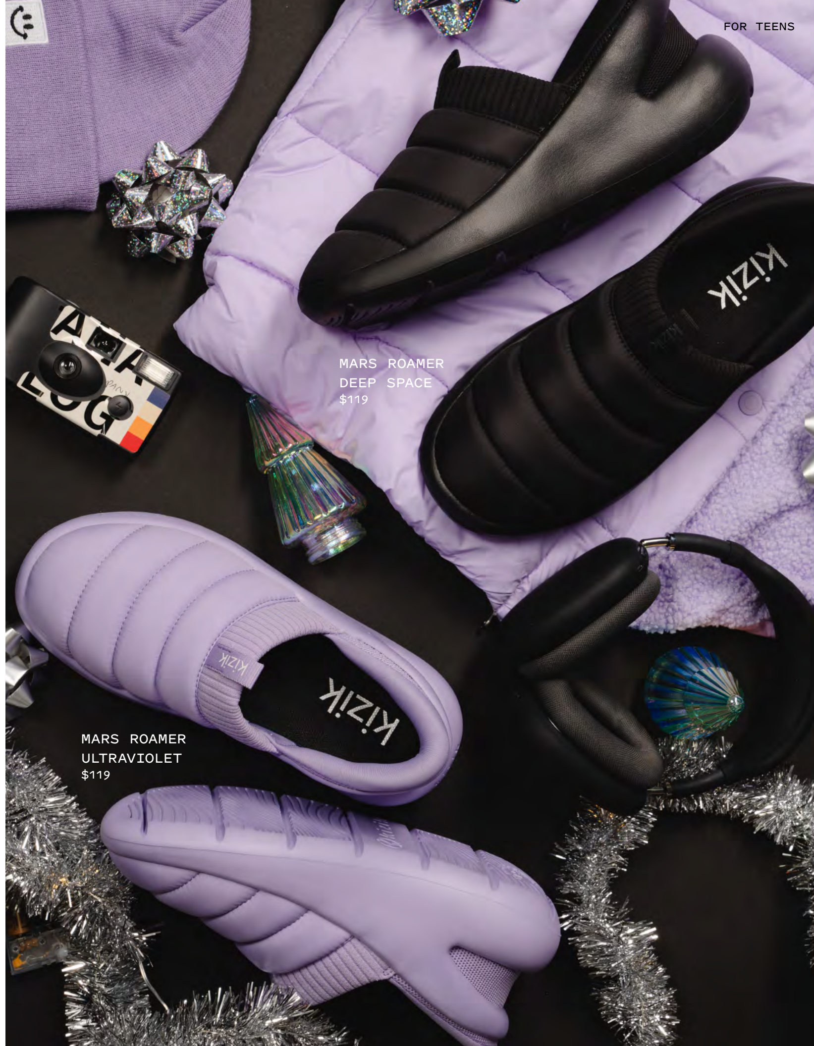
MARS ROAMER DEEP SPACE $119