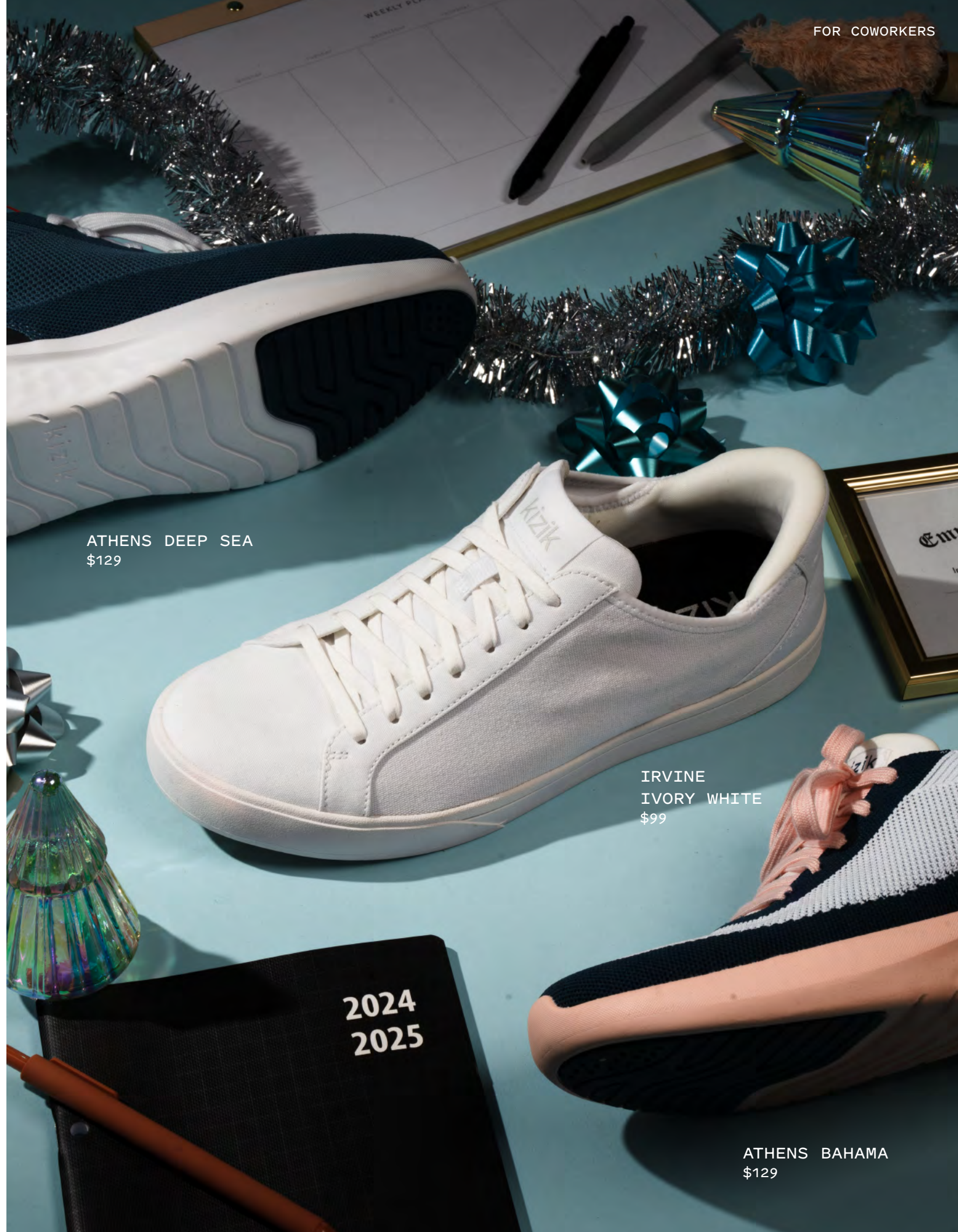
ATHENS DEEP SEA $129