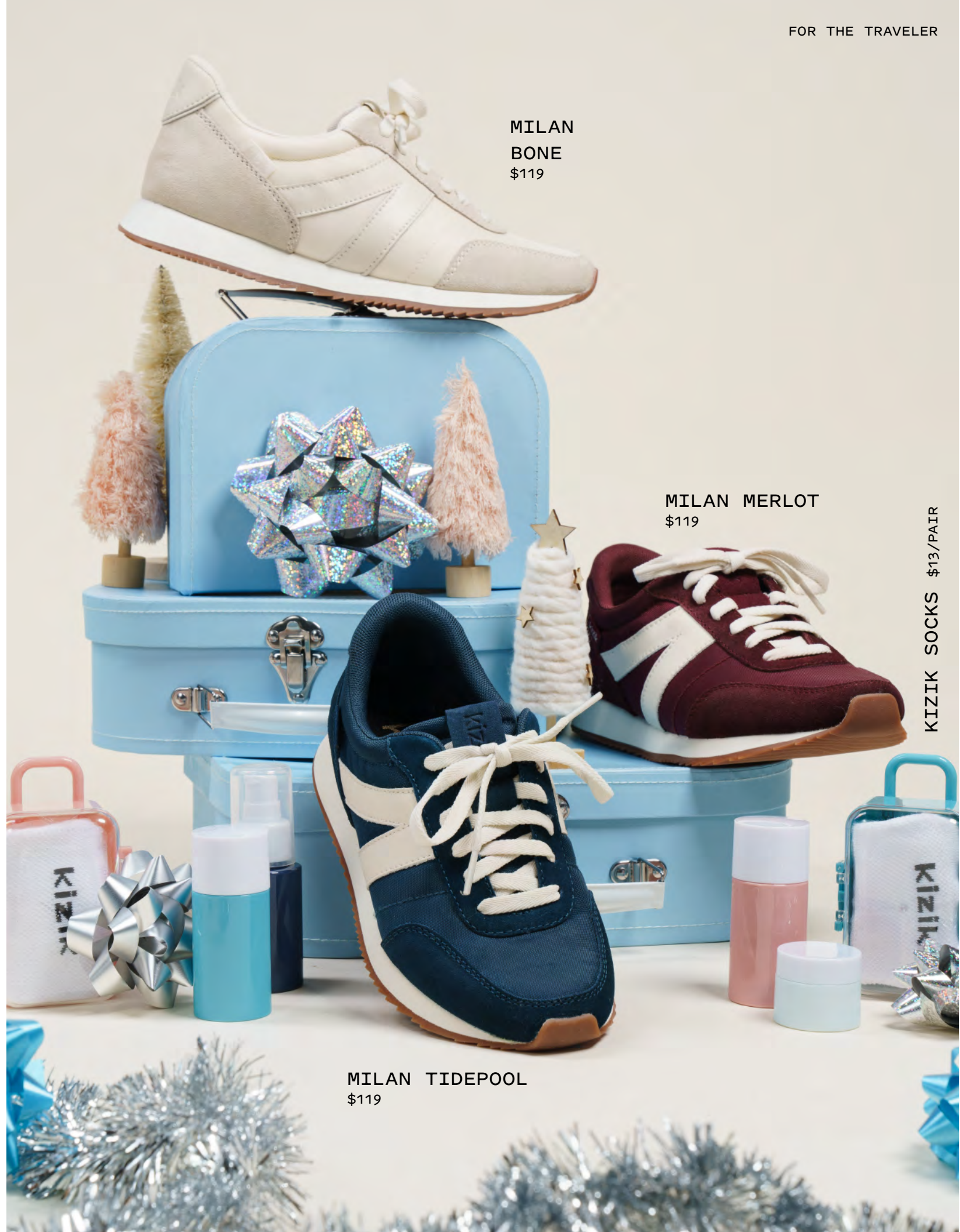
MILAN BONE $119