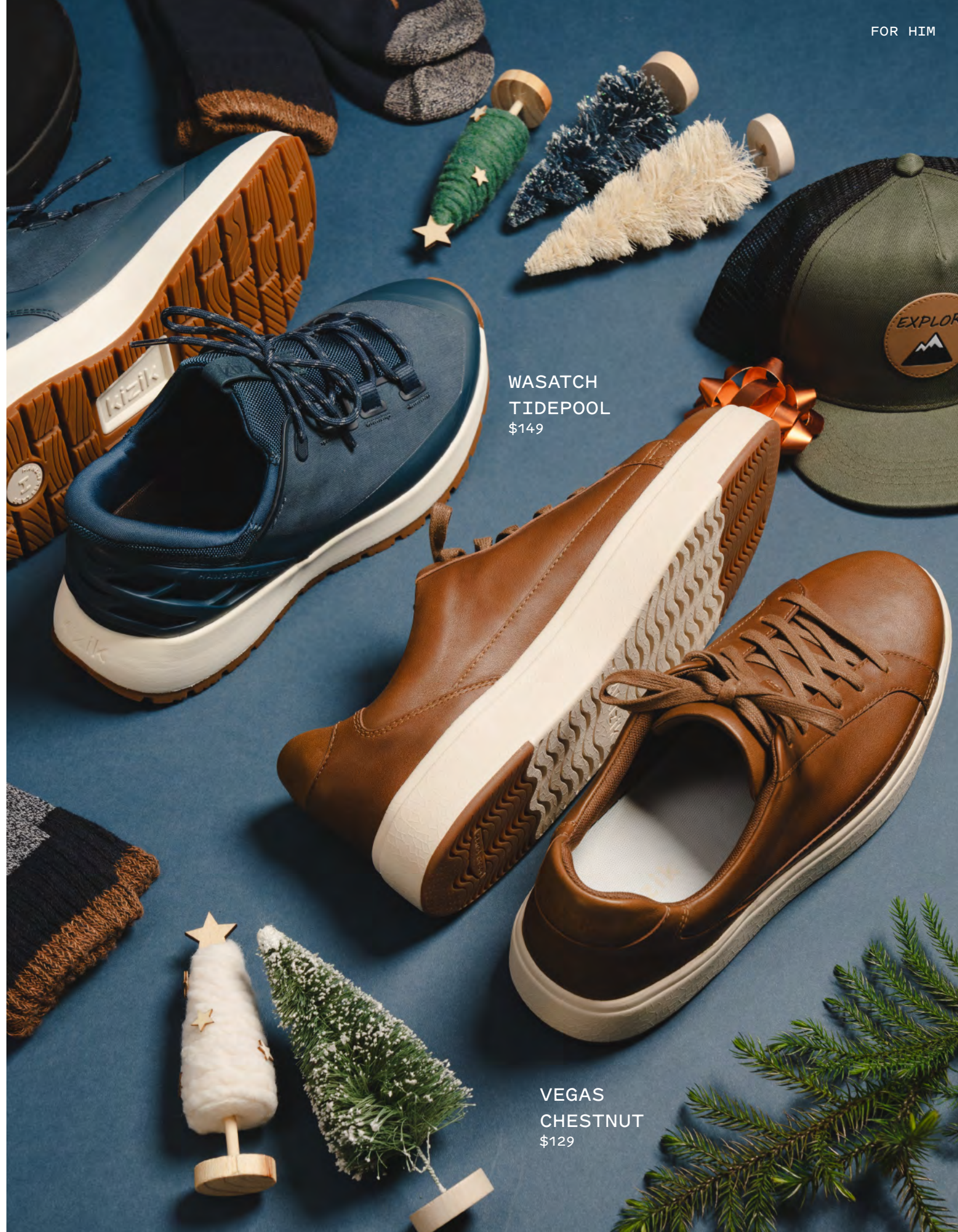
WASATCH TIDEPPOOL $149