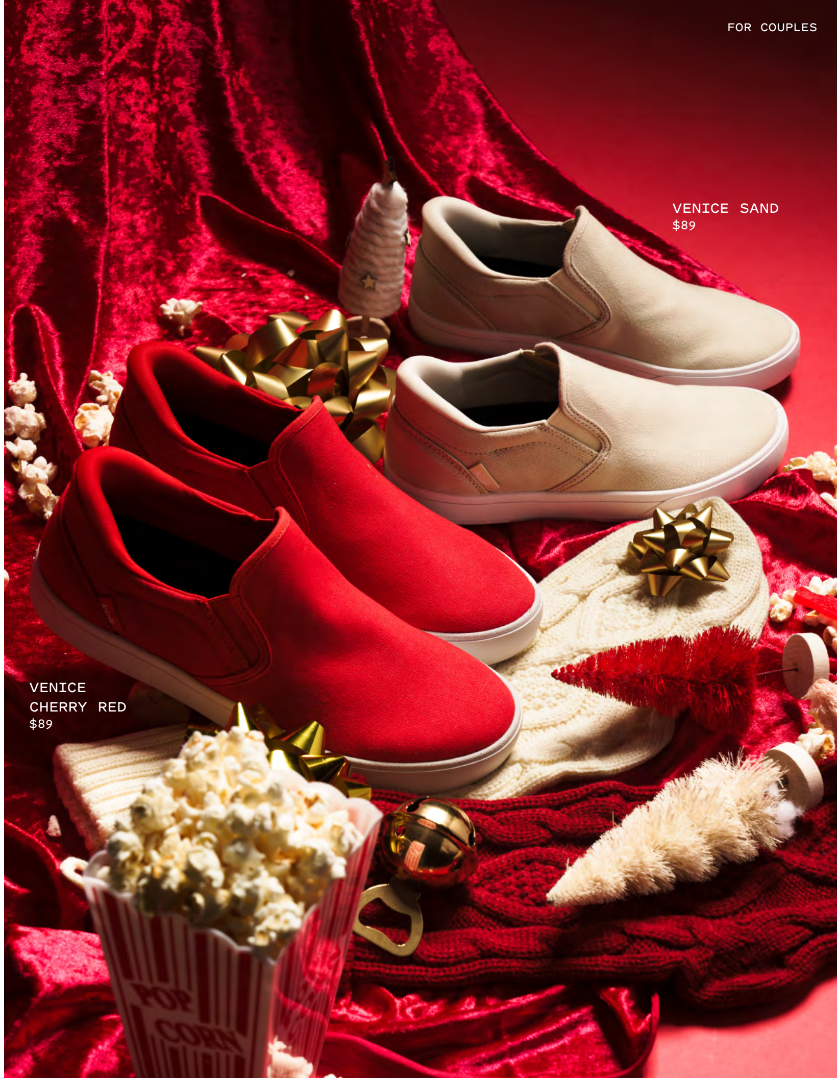
VENICE SAND $89