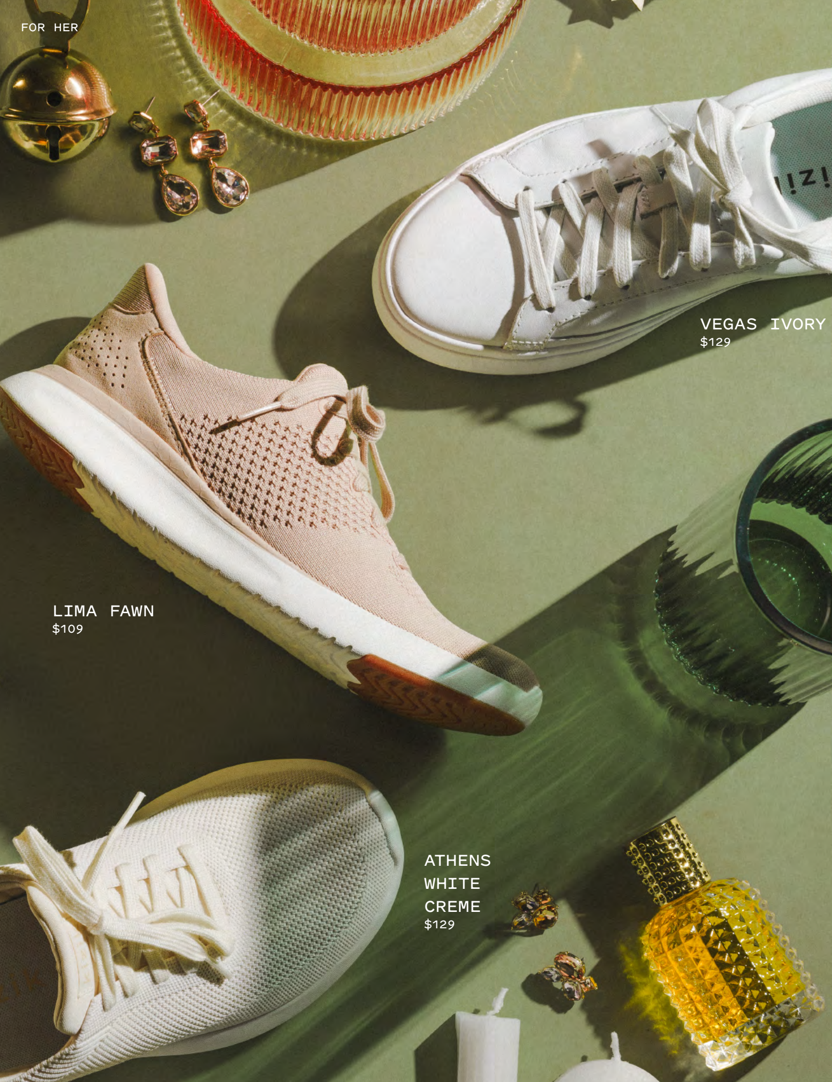
LIMA FAWN $109